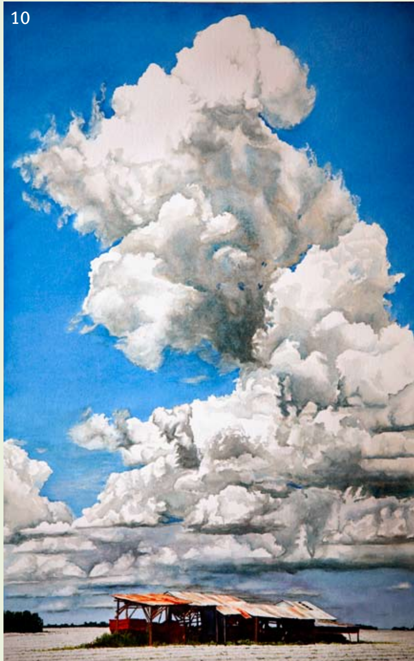
Delta Sky—Highway 61 (watercolor on paper, 28x18)