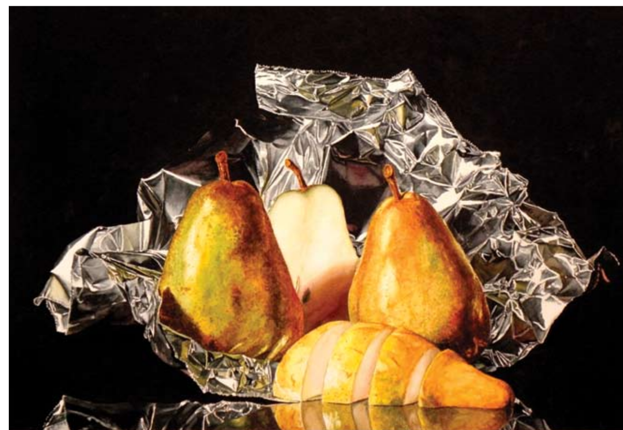
Updating the Classics In Yellow Pears in Foil (watercolor on paper, 10x13) I was looking for ways to bring the Dutch still life painters' approach to modern items. The lighting from the left and the strong background reflect the masters' unique painting style. The objects are a combination of old world fruit and a modern invention—aluminum foil, which was painted with a full range of grays, from light to very dense, applied with care.

In addition to changing the value of the base gray, I can also make it warmer or cooler. Adding more blue, such as Winsor or Prussian blue, makes a cool gray that's perfect for painting silver and other metals. More light red will make a warmer gray. To take it a step further, I very carefully add a bit of quinacridone gold as well. Too much of any yellow, gold or ochre can turn the gray a terribly muddy green very quickly, so I add only a bit at a time until I get the color I want. Warm grays can be used to indicate places where glass or silver reflects warm objects, such as oranges or red pears. They're also great for areas where crystal refracts light.